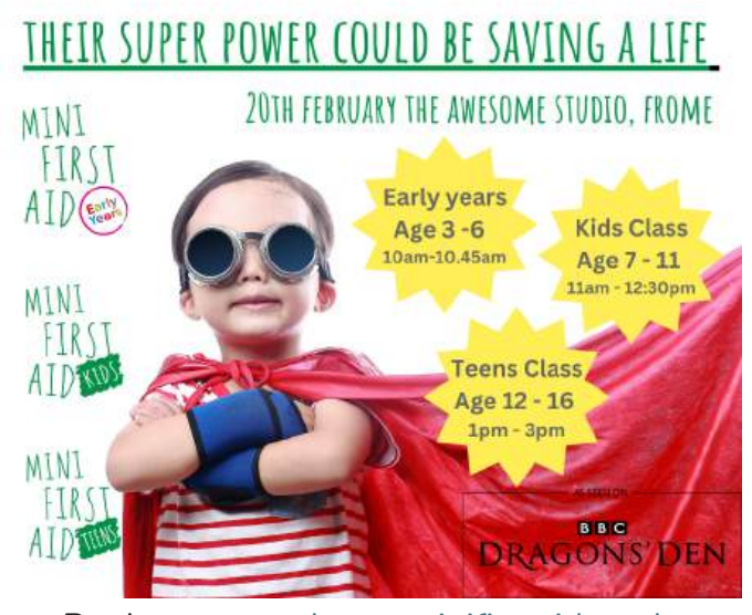
Book on www.dorset.minifirstaid.co.uk

Click here to find out how to get involved.