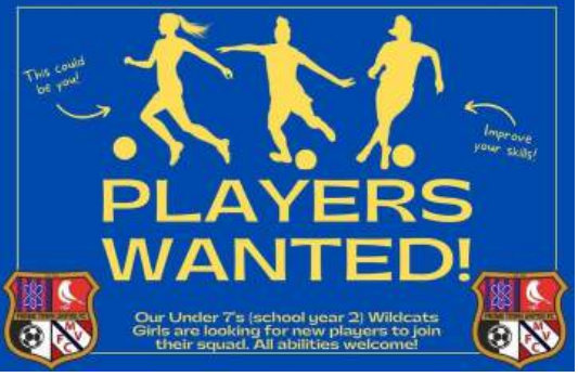
Click here for a Frome Town United FC 2024/2025 - New Player Form