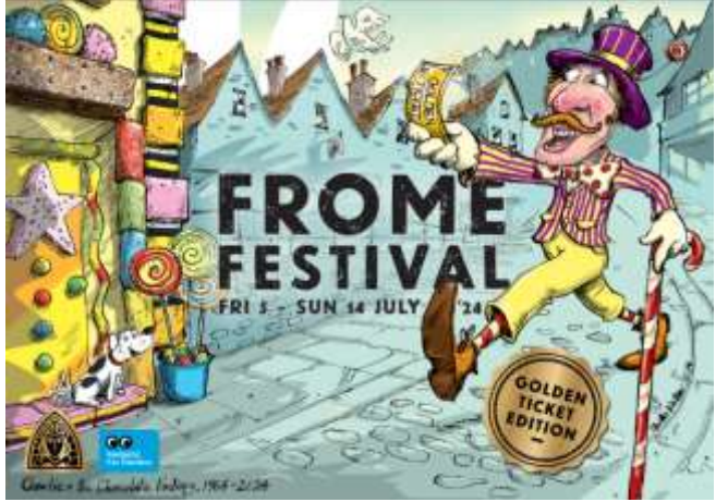
Please click the image to download the Frome Festival Brochure