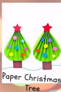
Paper Christmas Tree